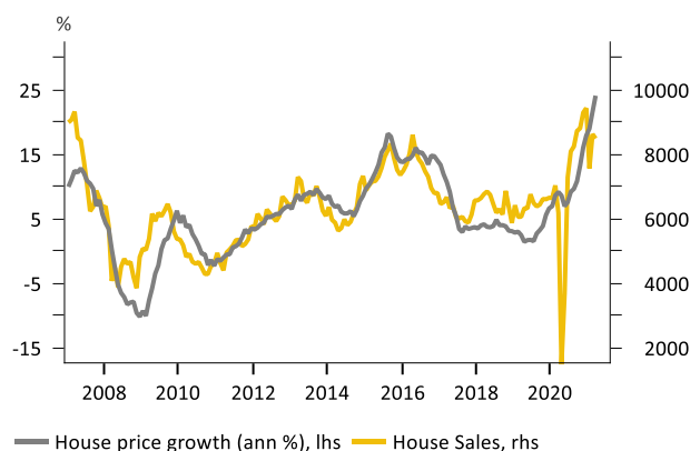
REINZ NZ house prices growth and house sales

It's now well understood that the cash flow implications of the removal of interest deductibility are material, particularly for highly-leveraged investors. Our own